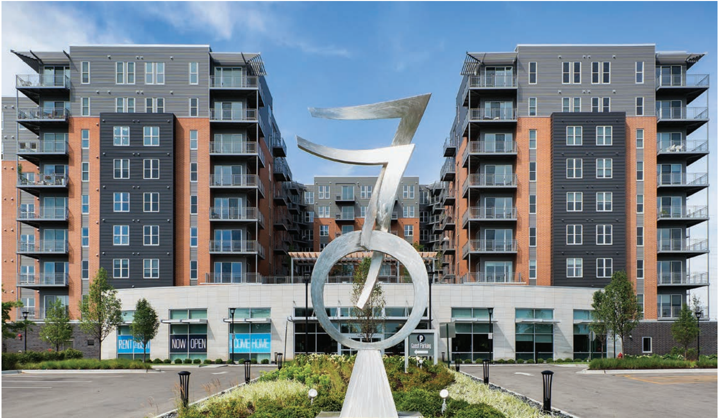
NorthShore 770 and Morningside Construction Managers