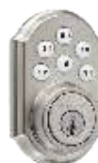
909 SmartCode™ 910 SmartCode™