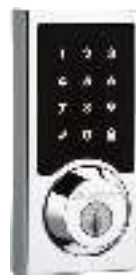
915 CNT SmartCode™ 916 CNT SmartCode™