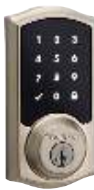
915 SmartCode™ 916 SmartCode™