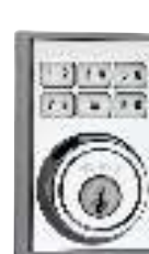
909 CNT SmartCode™ 910 CNT SmartCode™