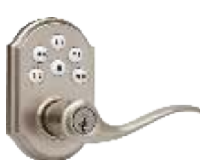
911 SmartCode™ Lever 912 SmartCode™ Lever