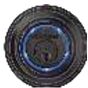
925 Kevo™ Bluetooth Enabled Touch to Open Deadbolt