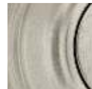
15 Satin Nickel