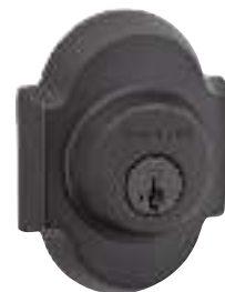
980 Austin Deadbolt