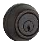
Signature Series Traditional