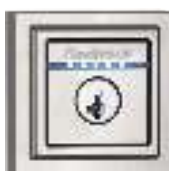
Kevo Touch-to-Open™ Deadbolt 2nd Gen, Contemporary Style