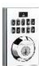
913 CNT SmartCode™ 914 CNT SmartCode™