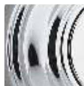
26 Polished Chrome