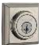
Signature Series Contemporary