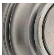
15A Antique Nickel