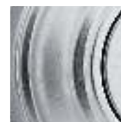
26D Satin Chrome