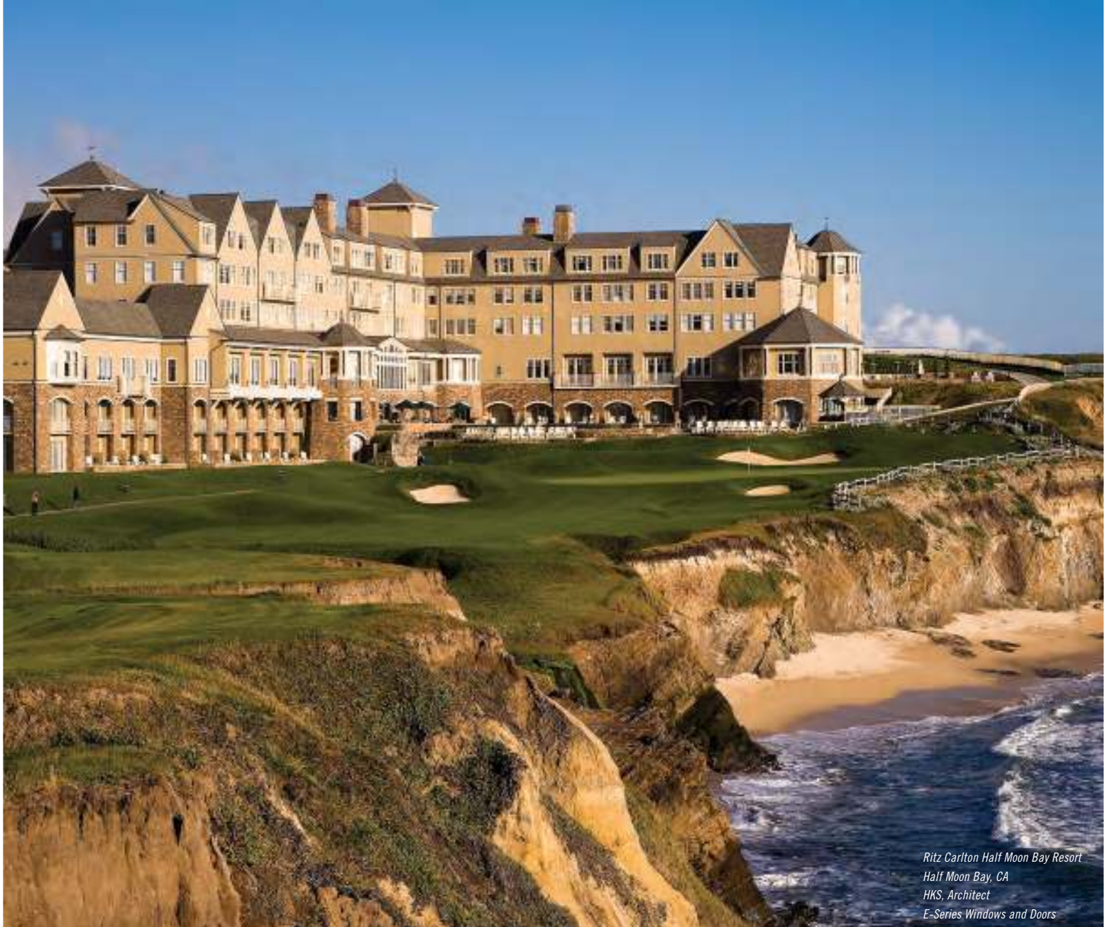
Ritz Carlton Half Moon Bay Resort Half Moon Bay, CA HKS, Architect E-Series Windows and Doors