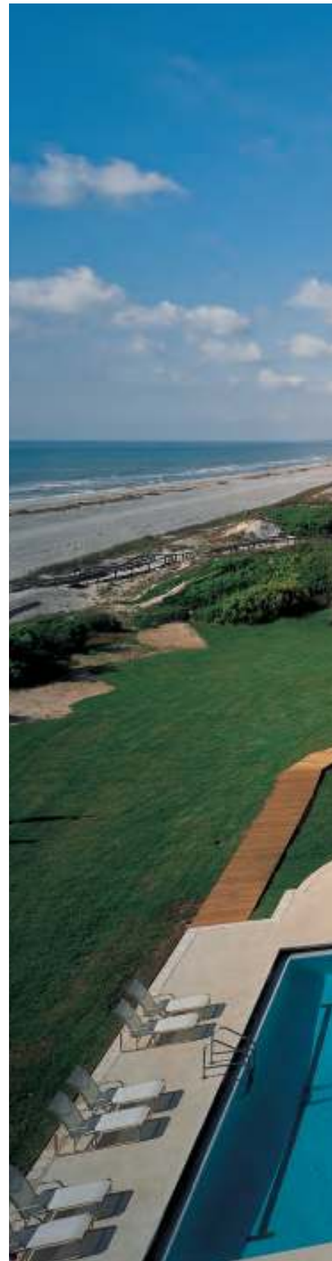
Beachside Villas Amelia Island, FL Adache Associates Architects, P.A. The Auchter Company Andersen® Windows and Doors

Product specs in 3-part CSI specifications format are available from Arcat as a document covering every product. Or use Arcat's "SpecWizard," a question-driven tool that will write the specifications only for the products and options you select for the project. Available in Word, WP, and RTF formats. Visit EagleWindow.com/wintelligence .