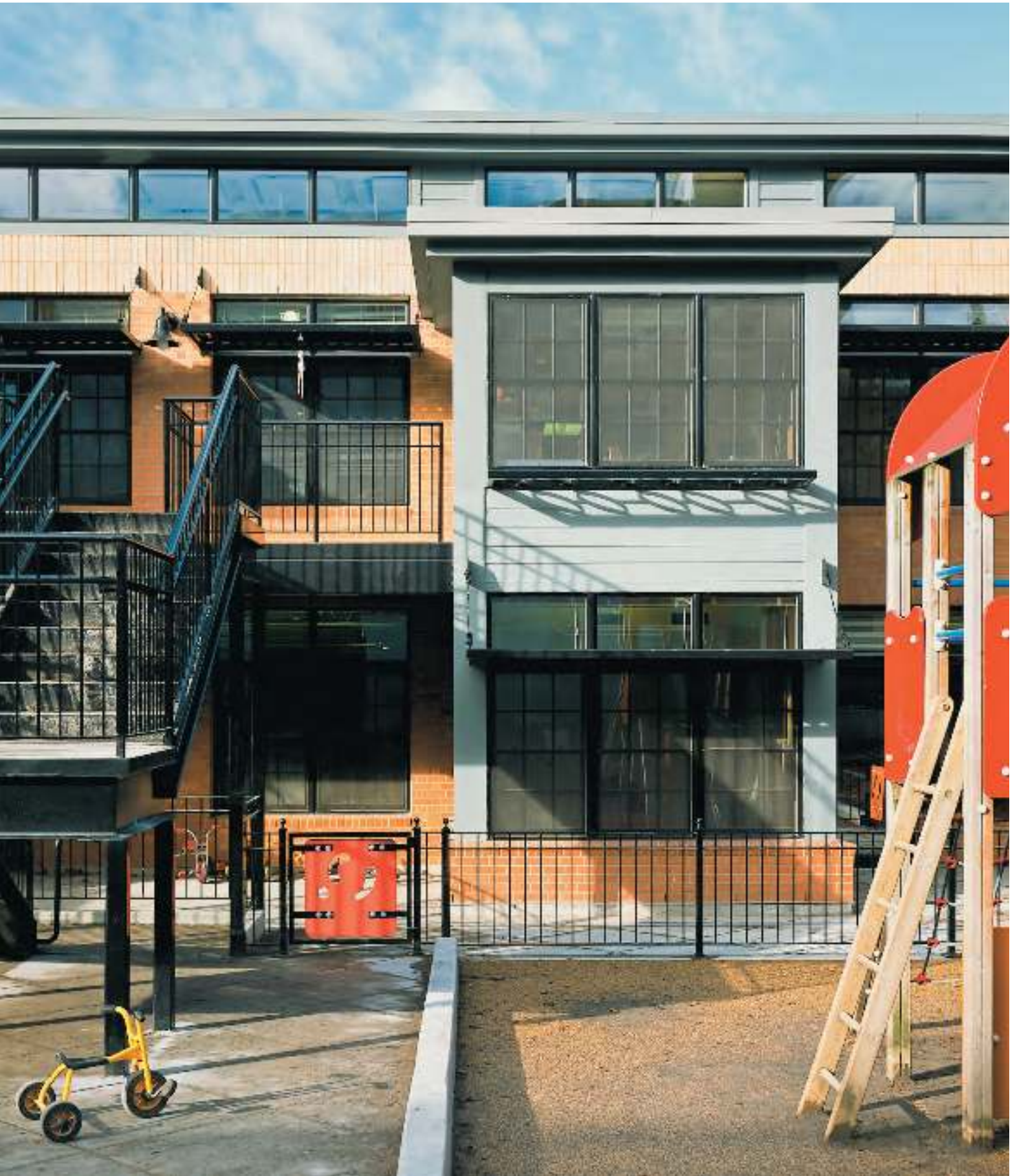
Helen Gordon Child Development Center Portland, OR GBD Architects E-Series Windows and Doors