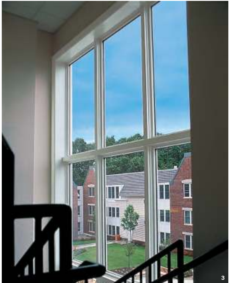
1. Kensington Park Kensington, MD Beery Rio & Associates Glen Construction Company Andersen® Windows and Doors