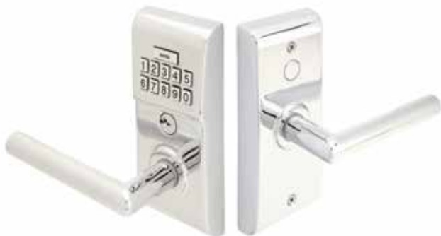
Exterior Trim Interior Trim

Shown in Polished Chrome (US26) finish with Stuttgart Levers*