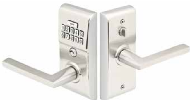
Exterior Trim Interior Trim

Shown in Satin Nickel (US15) finish with Helios Levers*