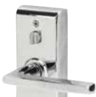
Passage Function Shown in Passage Mode