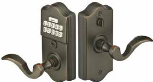
Exterior Trim Interior Trim

Shown in Oil Rubbed Bronze (US10B) finish with Cortina Levers*