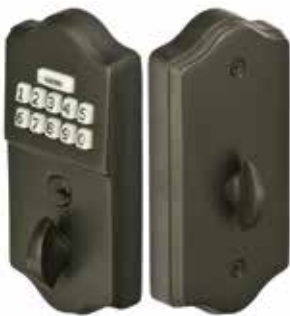
Exterior Trim Interior Trim

Shown in Oil Rubbed Bronze (US10B) finish